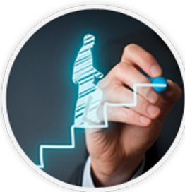
Child Support Challenges